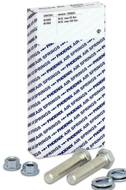
Pic.2: Screwkit for trailer applications

ContiTech Air Spring Systems is now offering screw kits for nearly 200 fast-movers of our ContiTech and Phoenix range. The packages include all relevant mounting parts for your individual application.