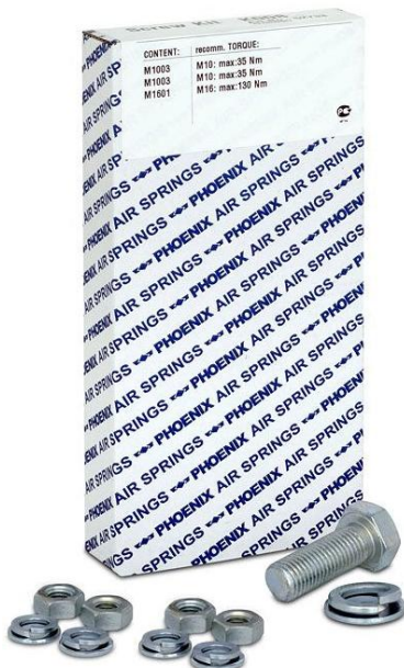
Pic.1: Screwkit for bus & truck applications